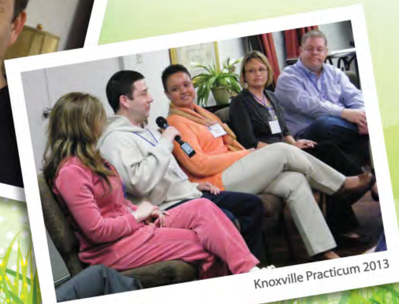
Knoxville Practicum 2013