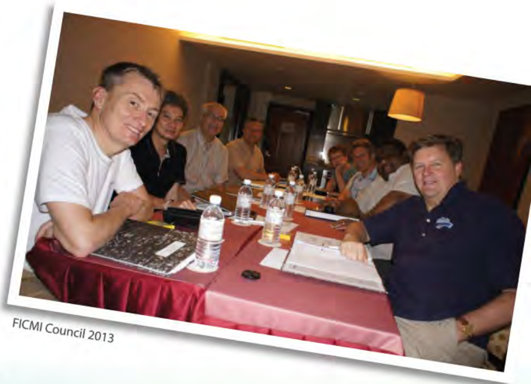
FICMI Council 2013

Please keep praying with us and for us. We will not be done until people from every tribe, tongue, people and nation are ushered into Christ's kingdom...not just as converts but as growing, fruitful disciples.